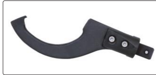
type O (optional)